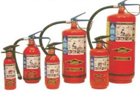
1KG 2KG 4KG 6KG 9KG