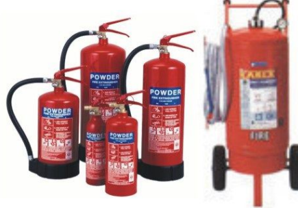
4KG 6KG 9KG 25KG