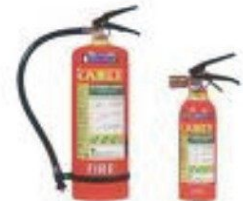
4 KG 2KG