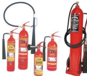
2KG 4.5KG 9KG